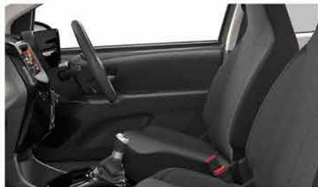
Grey 'Wave' cloth Standard on Flair versions