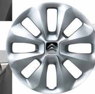
15 inch 'Planet' alloy wheels Standard on Flair versions, optional on Feel versions