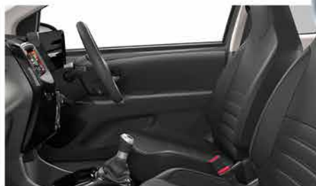
Black leather Optional on Flair versions. Unavailable on Airscape versions.