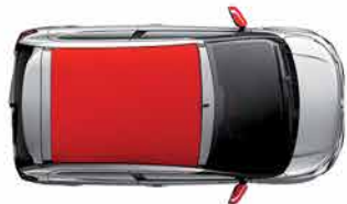
Sunrise Red fabric roof Optional on Feel & Flair Airscape versions