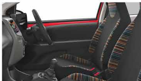
Light 'Zebra' cloth Standard on Feel versions