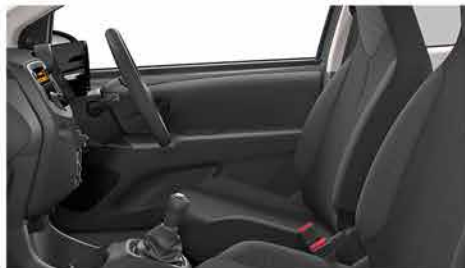
Grey 'Mica' cloth Standard on Touch versions