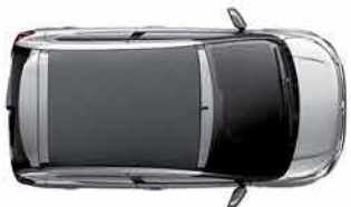
Grey fabric roof No cost option on Feel & Flair Airscape versions