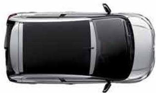
Black fabric roof Standard on Feel & Flair Airscape versions